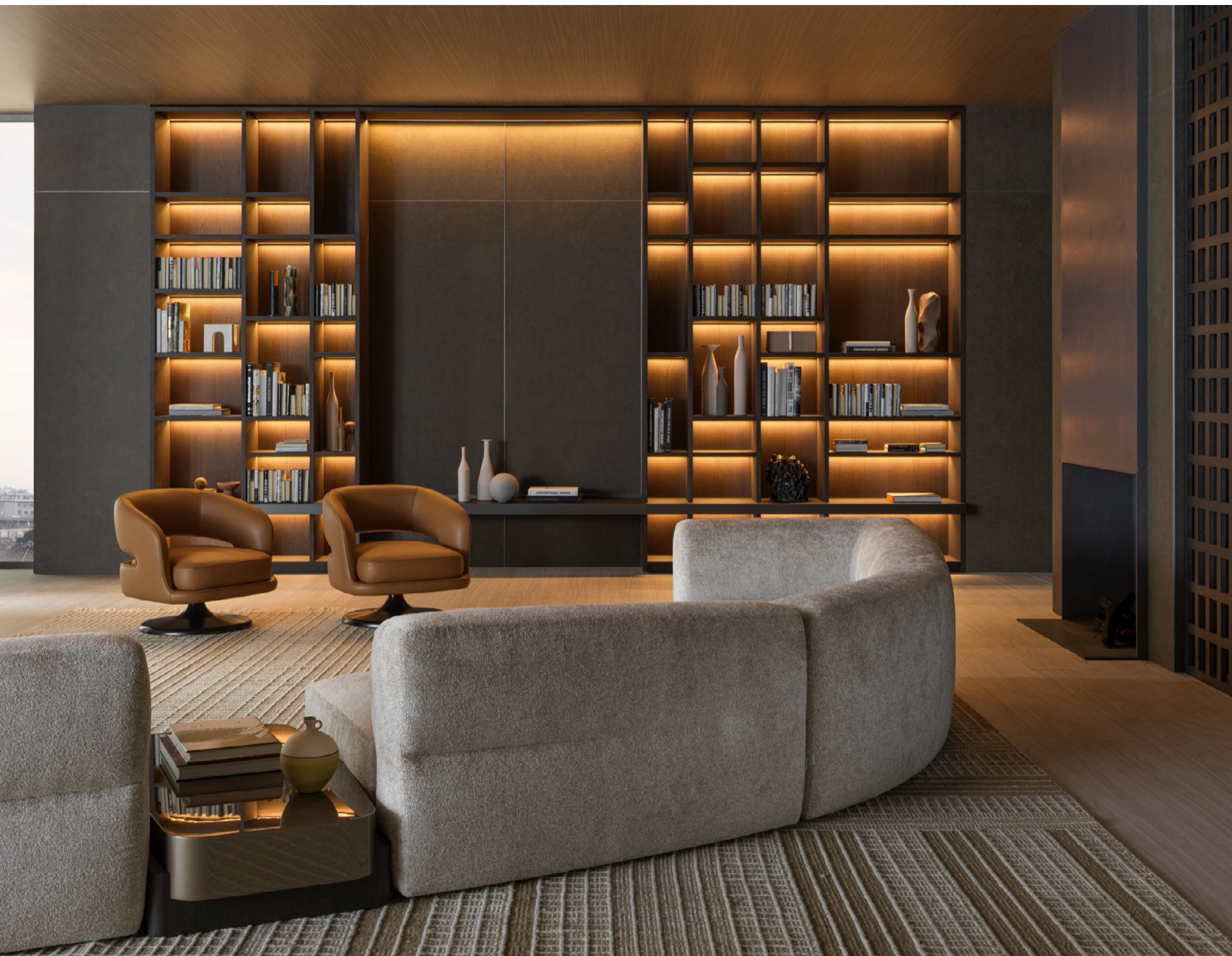
Emile Seating System Christophe Delcourt Odile Coffee table Christophe Delcourt