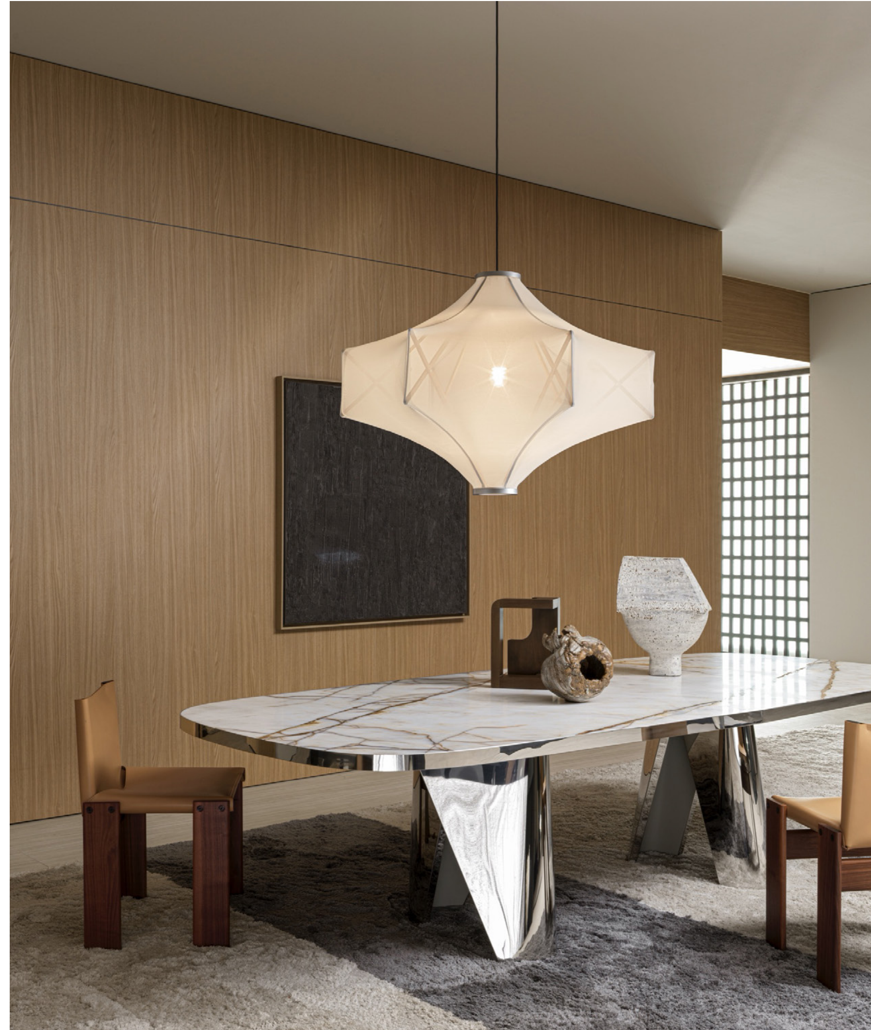
Arial Boiserie Studio Klass Eone Carpet Nicola Gallizia