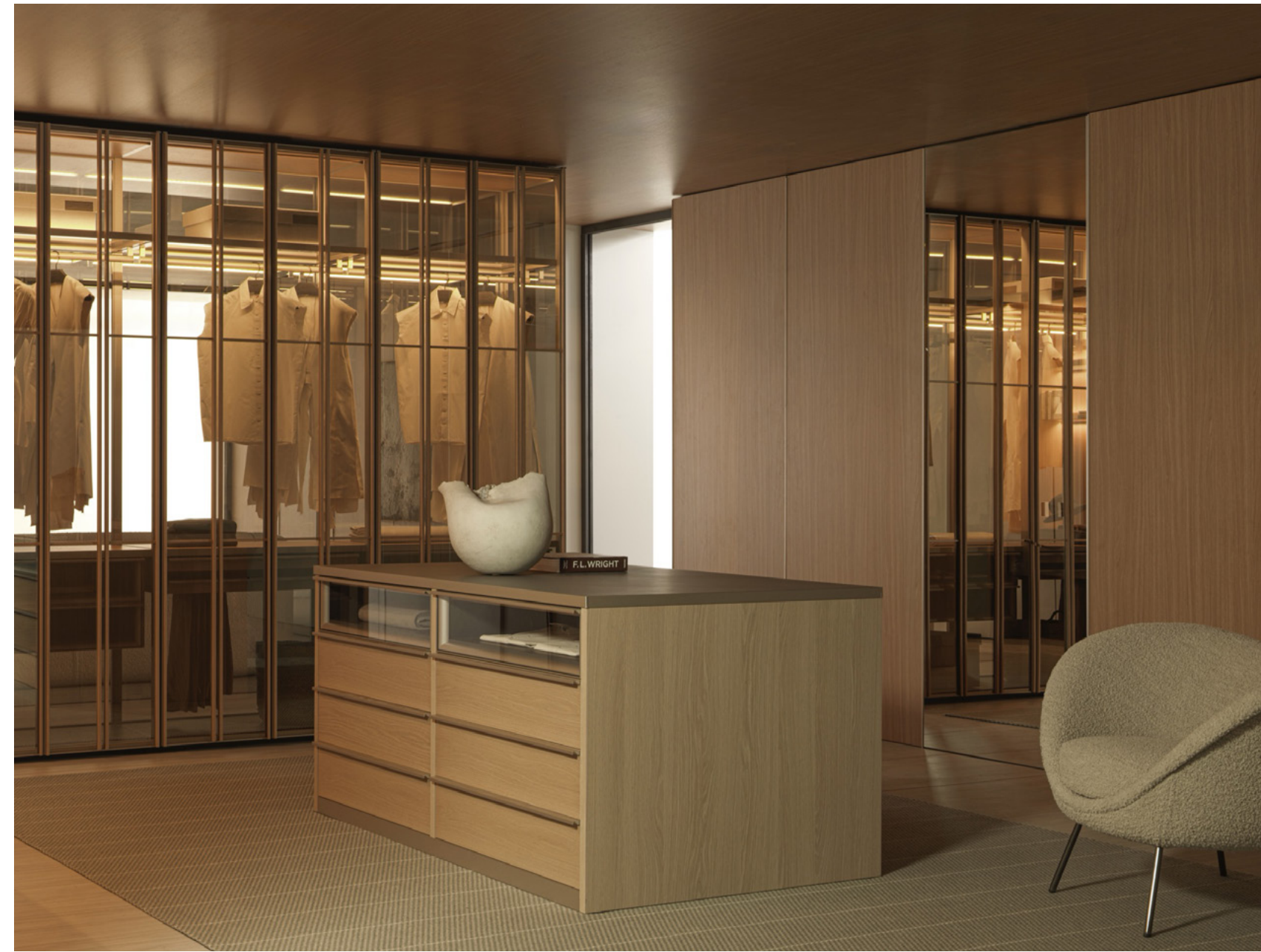
Gliss Master Wardrobe Vincent Van Duysen Gliss Master - Meridian Doors Studio Klass