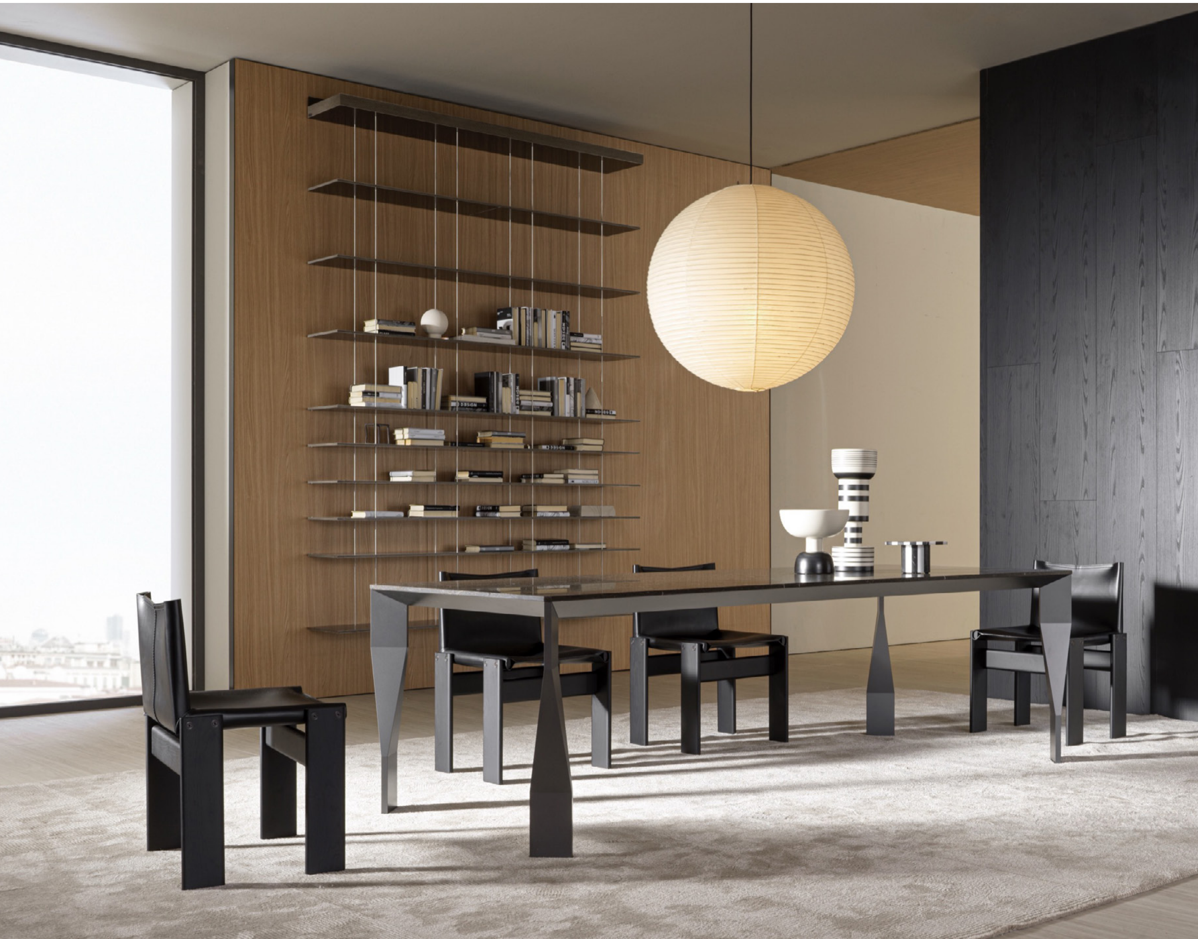
Diamond Table Patricia Urquiola Monk Chairs Tobia Scarpa