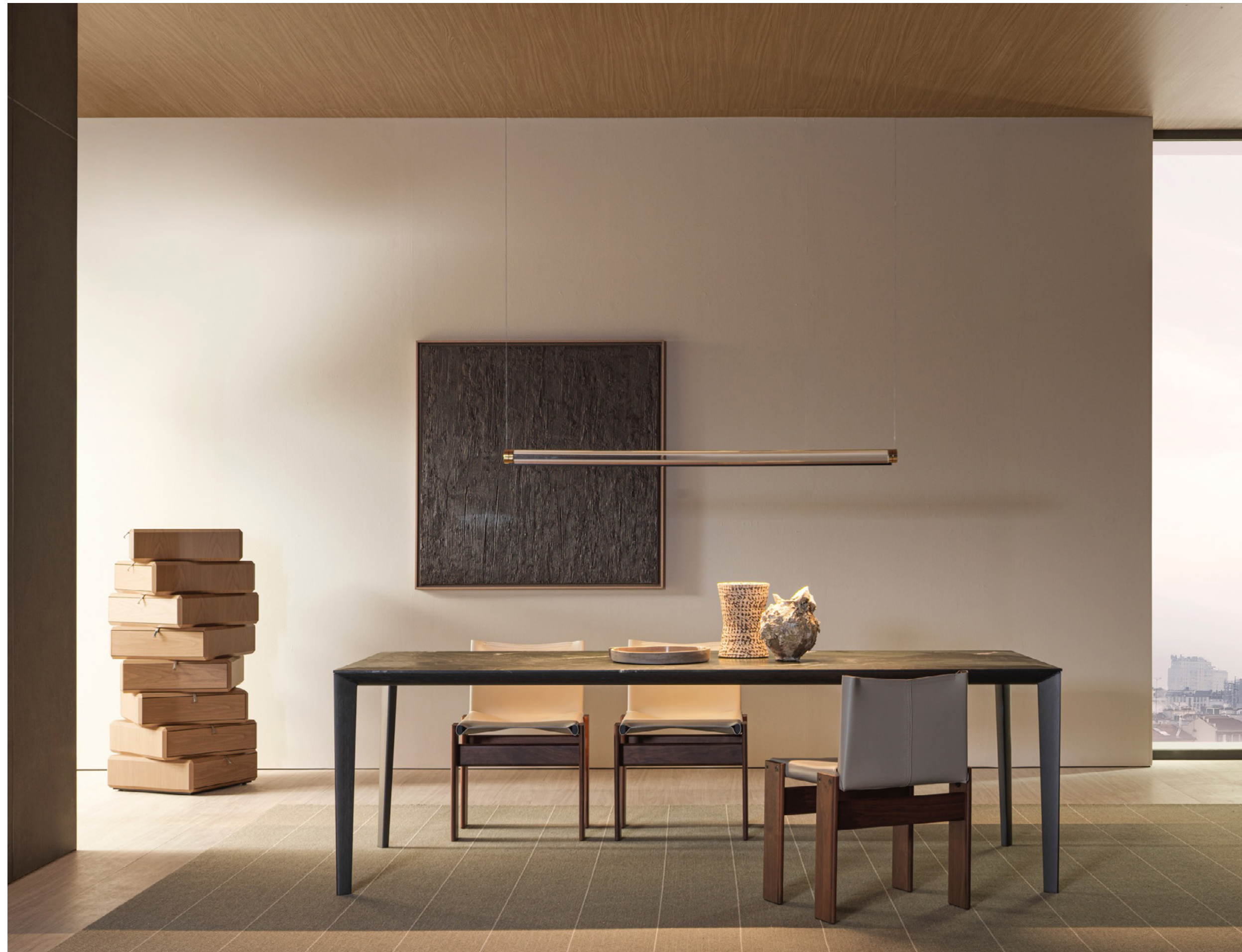
Filigree Table Rodolfo Dordoni