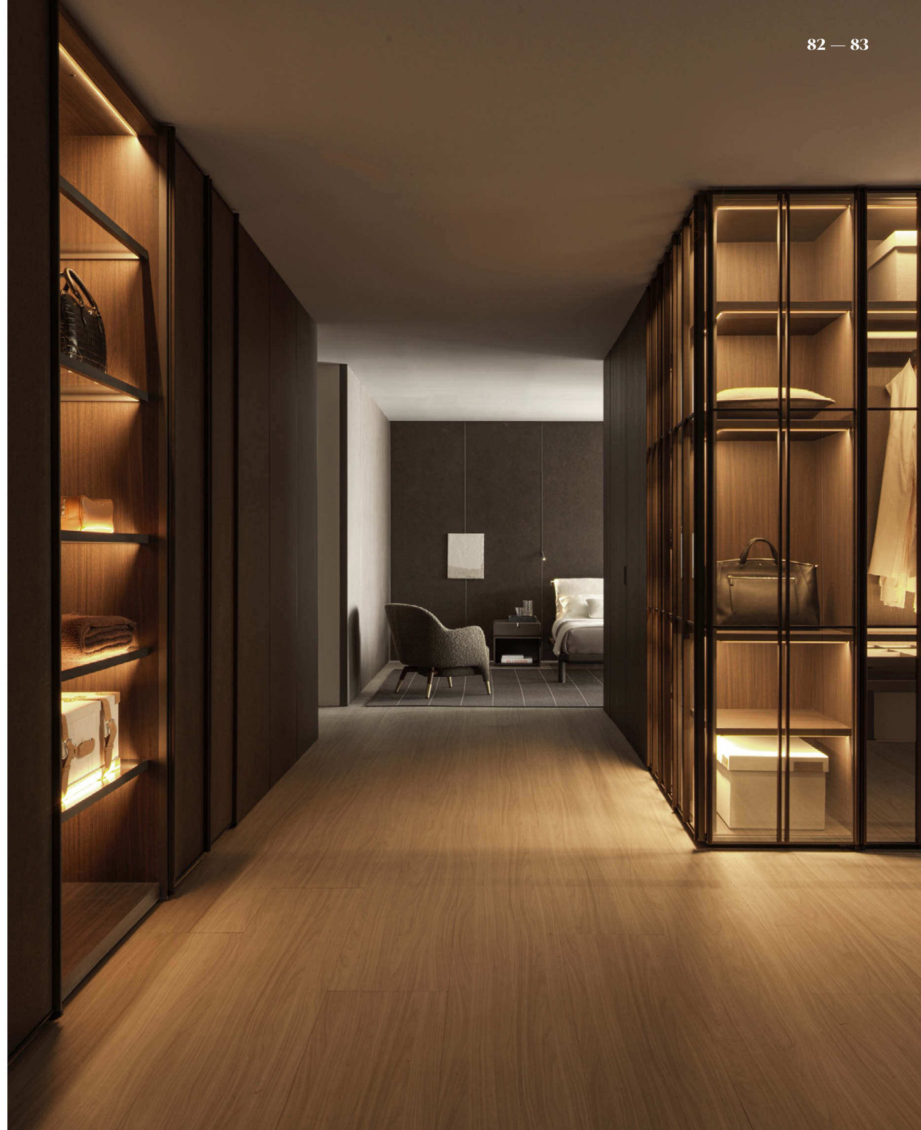
Gliss Master Wardrobe Vincent Van Duysen Gliss Master - Meridian Doors Studio Klass