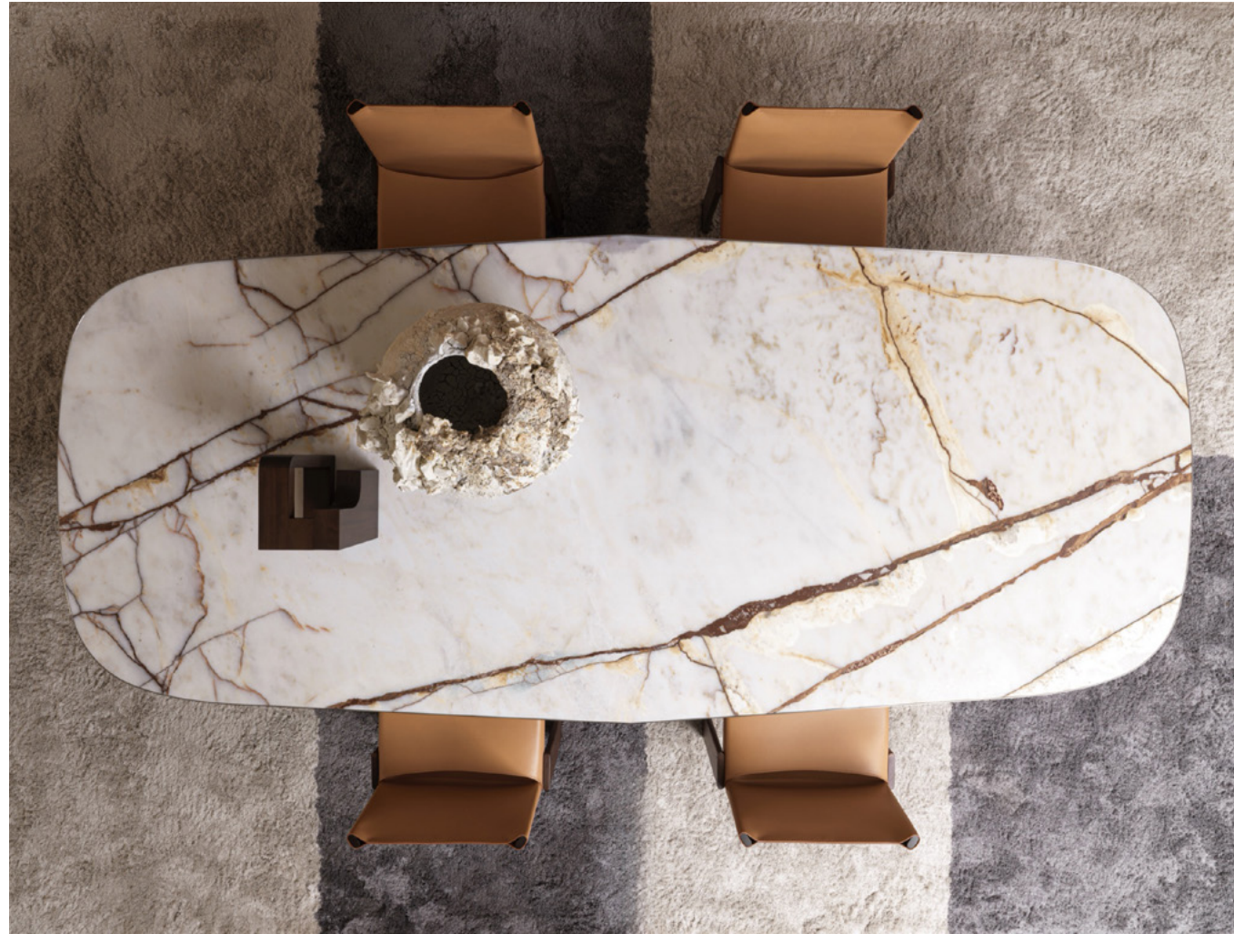
Lise Table Christophe Delcourt Monk Chairs Tobia Scarpa