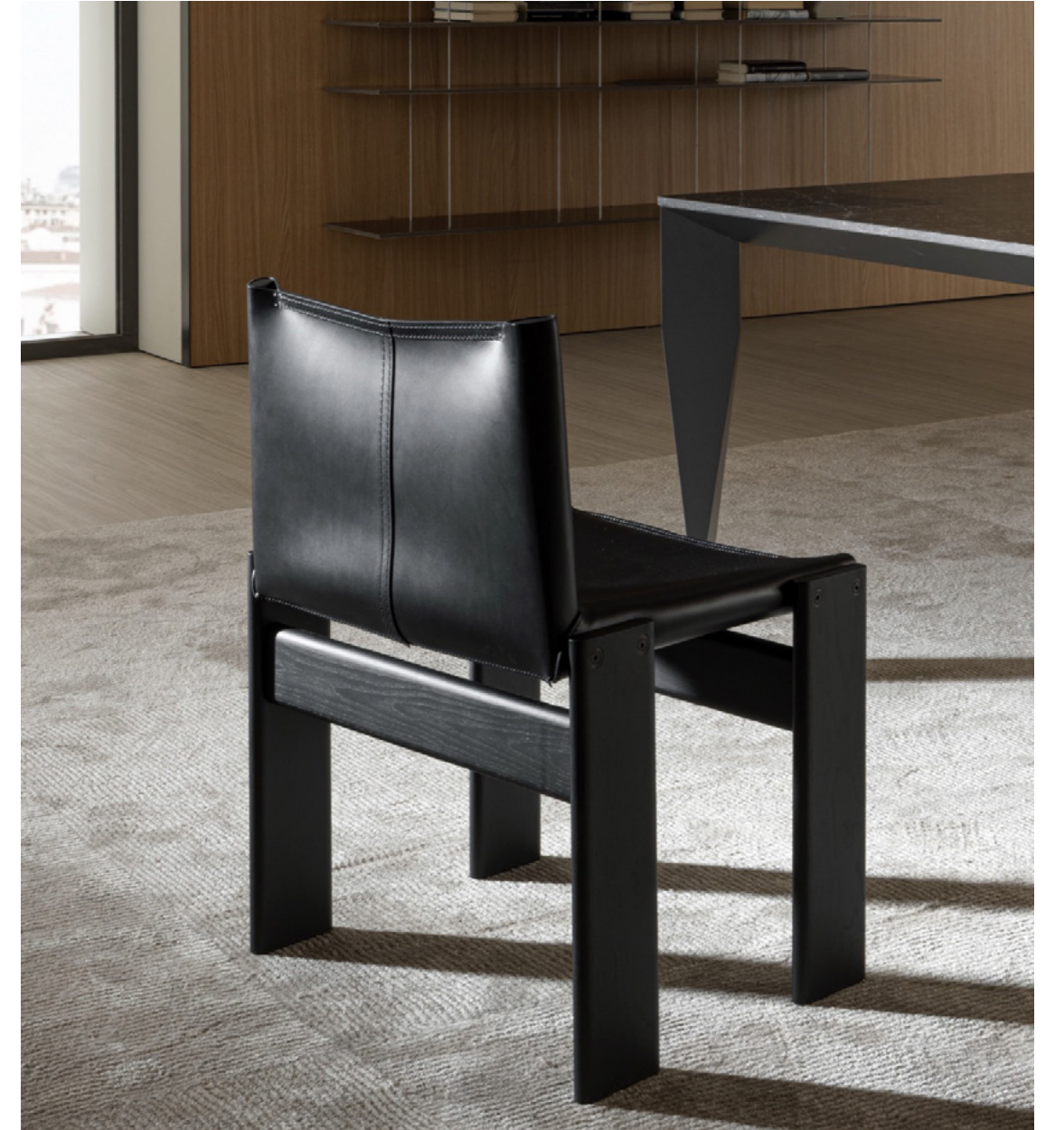
Diamond Table Patricia Urquiola Monk Chairs Tobia Scarpa Stripe Carpet Vincent Van Duysen