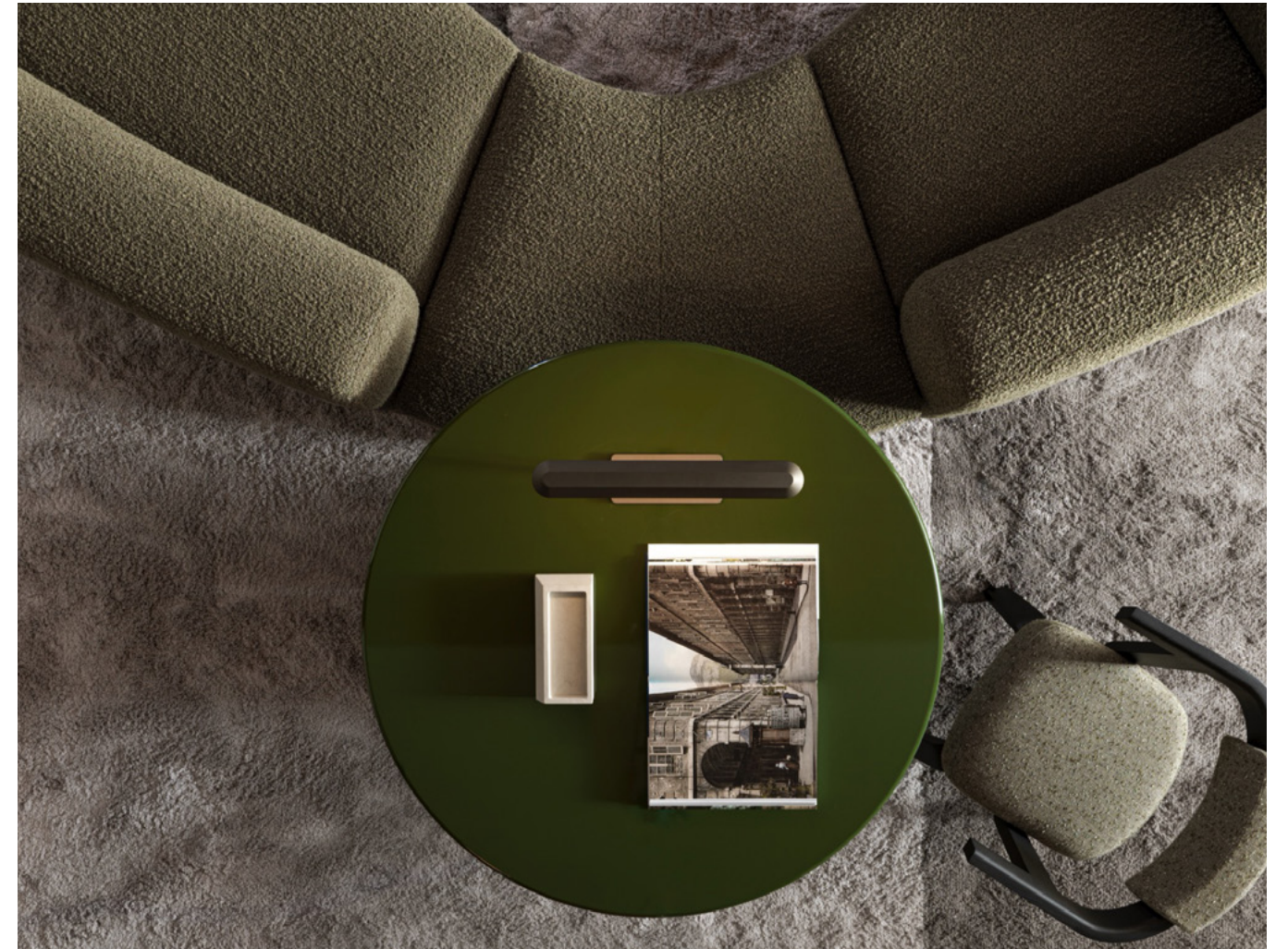
Emile Seating System Christophe Delcourt Mateo Table Vincent Van Duysen