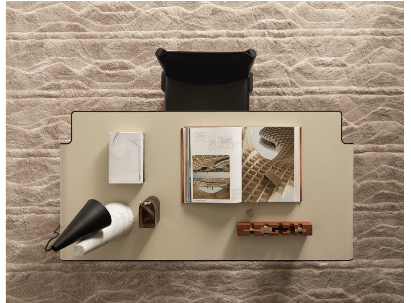
Aria Writing desk Vincent Van Duysen Monk Chair Tobia Scarpa