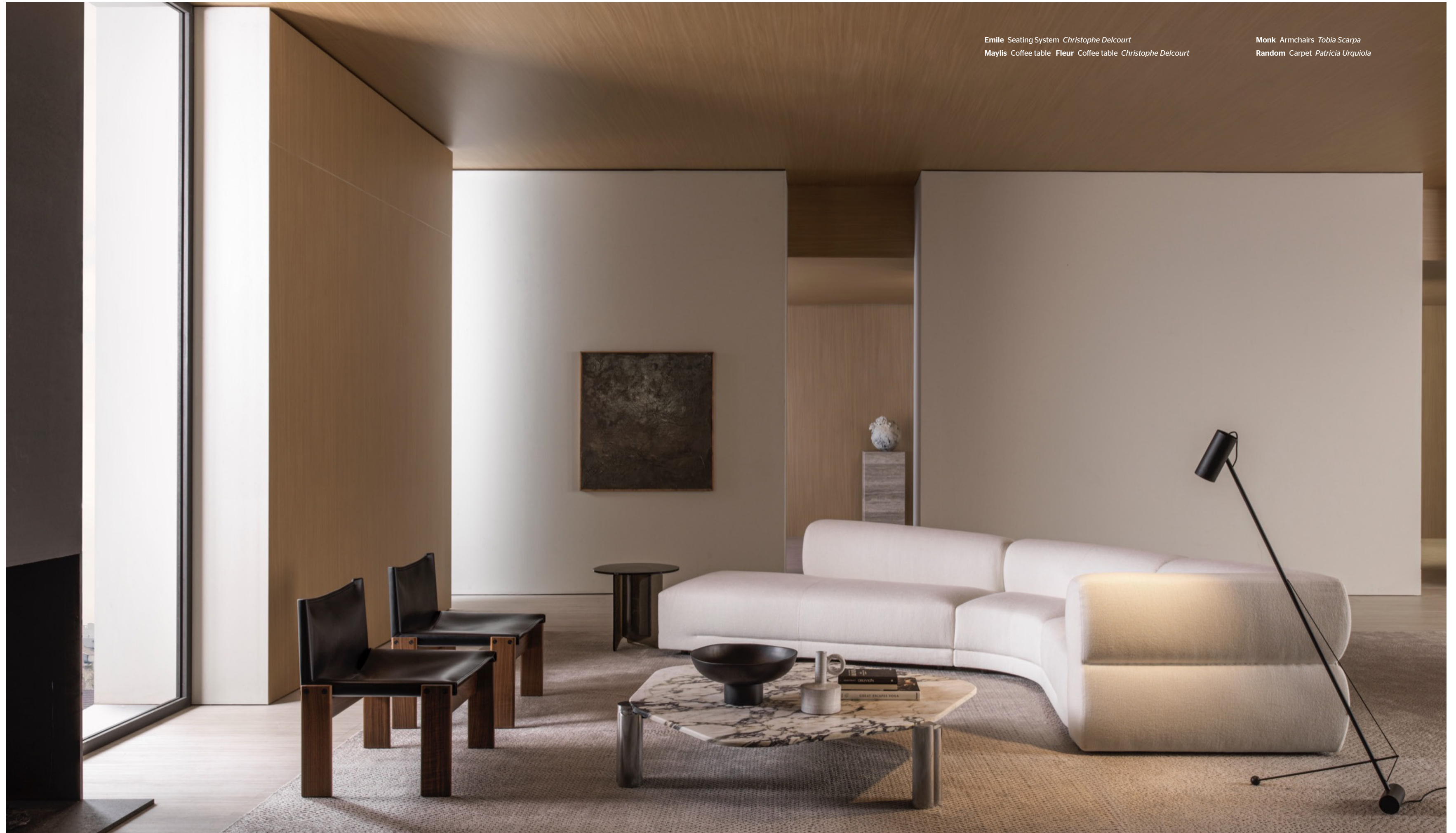
Random Carpet Patricia Urquiola