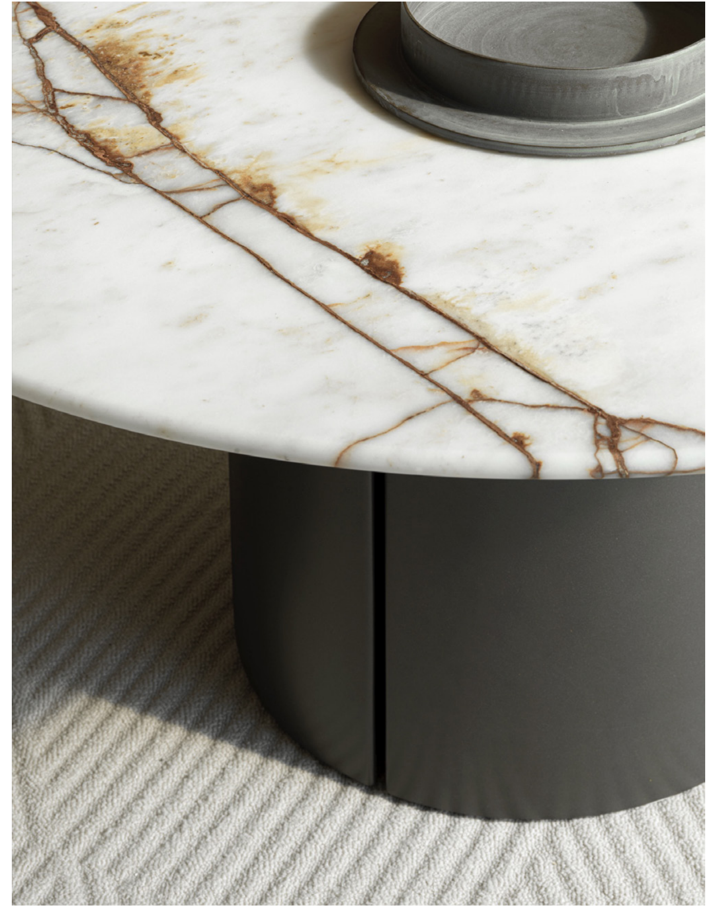
Mateo Table Vincent Van Duysen