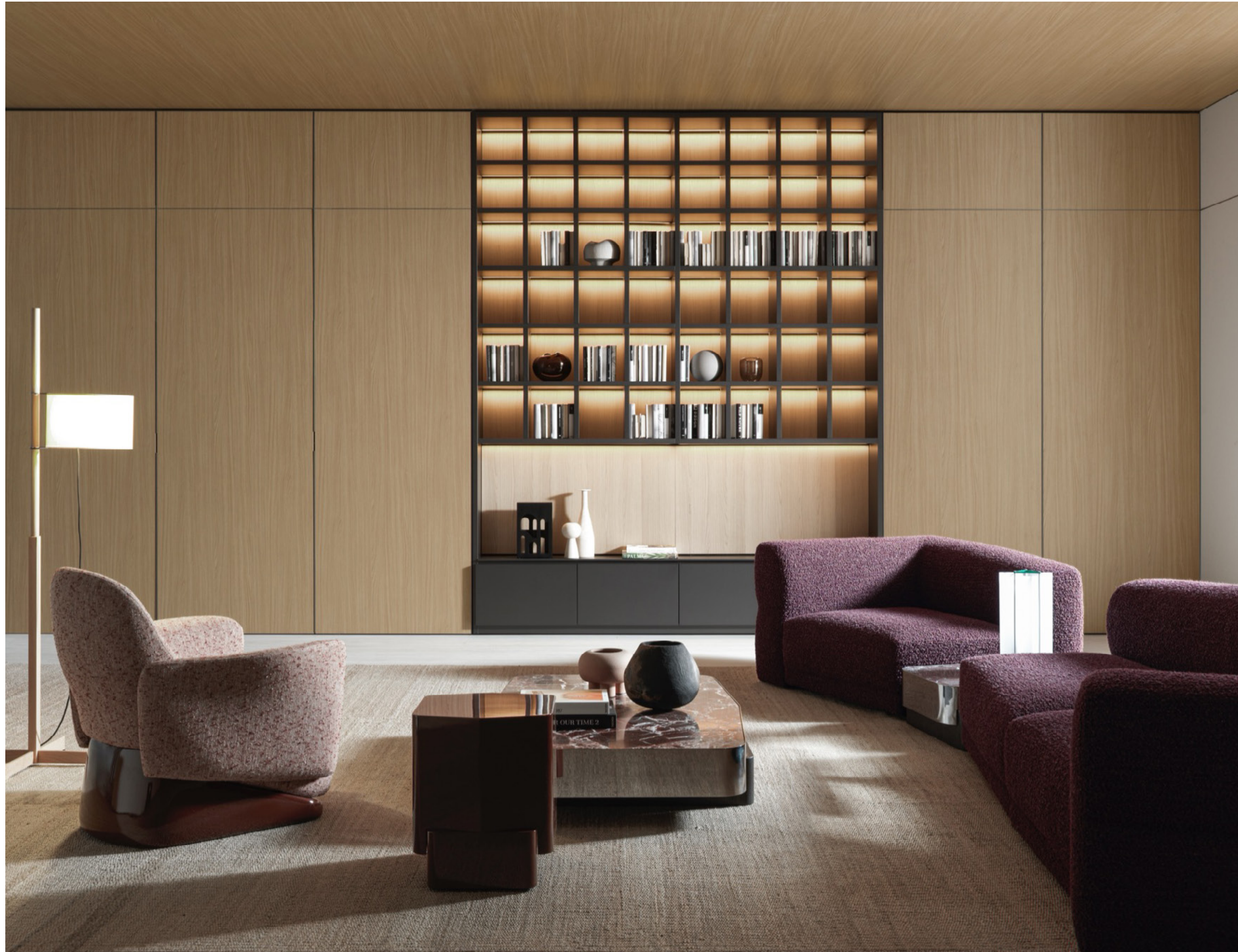
Emile Seating System Eugène Armchair Christophe Delcourt Odile, Léa Coffee tables Christophe Delcourt