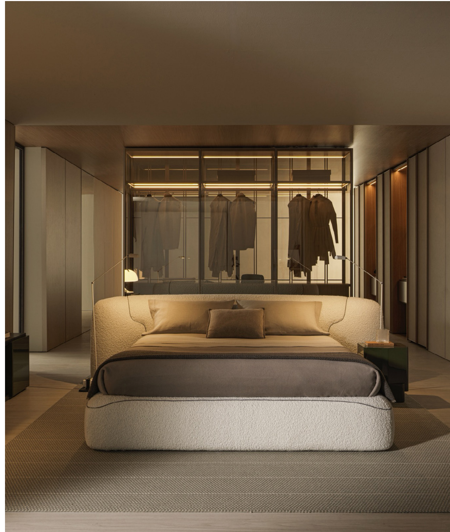
Theo Bed Yabu Pushelberg Arial Boiserie, door Studio Klass