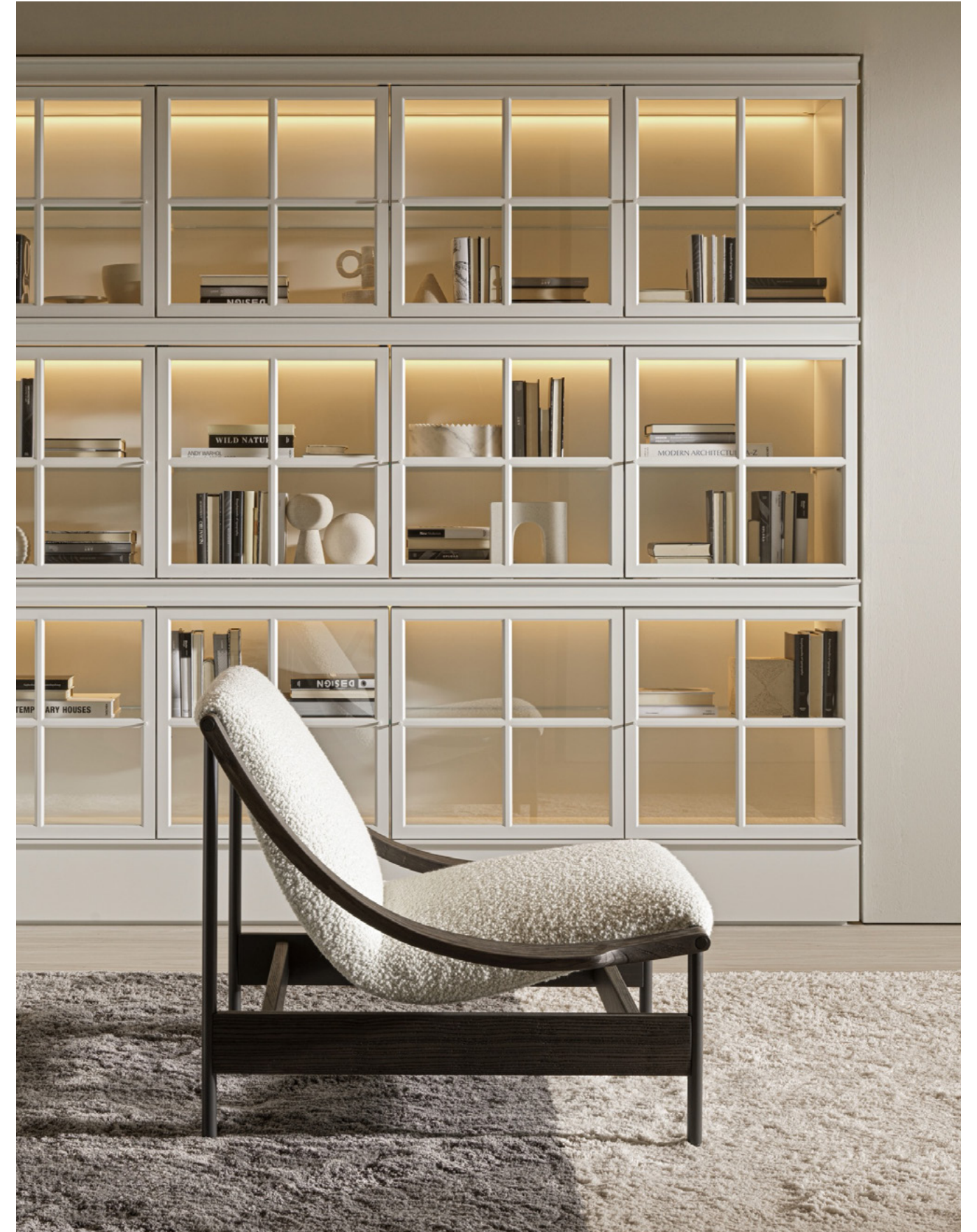
Lia Armchair GamFratesi Piroscalo Bookcase Aldo Rossi, Luca Meda Eone Carpet Nicola Gallizia